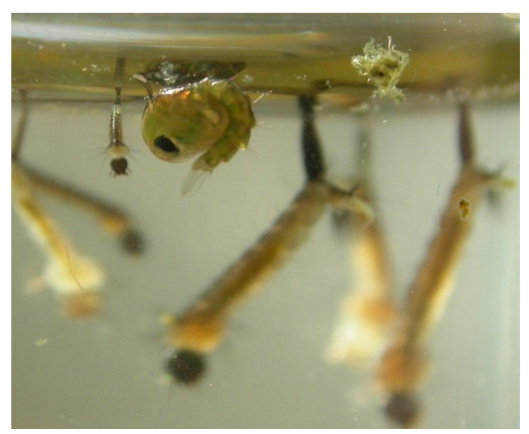
Figure 3. Pupa of a mosquito in the foreground with the larvae in the background.

Larvae then pupate in the water until the adult is ready to emerge. Pupae are often referred to as "tumblers," due to their characteristic movement when startled (Figure 3).