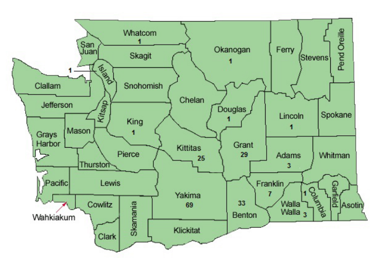
Figure 1. Accumulation of county reports for positive horse cases of WNV in Washington State from 2002 to 2015. Data courtesy Washington State Department of Health.

The WNV is present throughout North America and expected to remain endemic in most of the western hemisphere (Murray, Mertens, and Desprès 2010). Numbers of cases of WNV confirmed in Washington State horses between 2002 and 2015 is depicted in Figure 1.