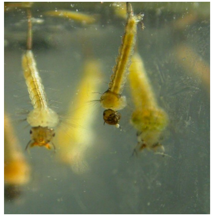
Figure 2. Larvae of mosquitoes suspended in pond water.

Mosquito eggs hatch into larvae, which are aquatic and need standing water to filter-feed on organic debris in the water (Figure 2). Mosquito larvae have a characteristic breathing tube. When startled, larvae wiggle away from the water's surface to seek protection in deeper water.